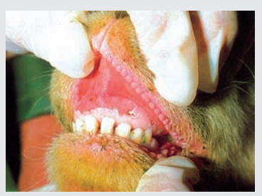
Foot and Mouth Disease (FMD)